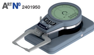
wireless charging pad with power supply